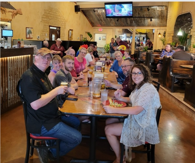
Nobles & Ladies enjoy Southway pizza after the Roundup parade.