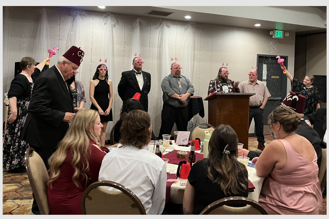
The newest members of the Klown's Flamingo Flock.