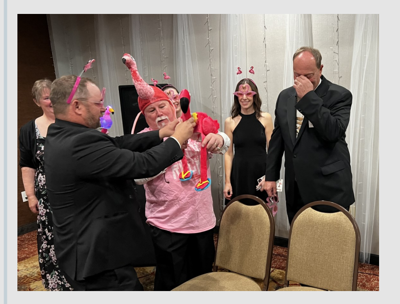
The Klown's Flamingo Degree was a crowd affair at the Potentate's Ball.