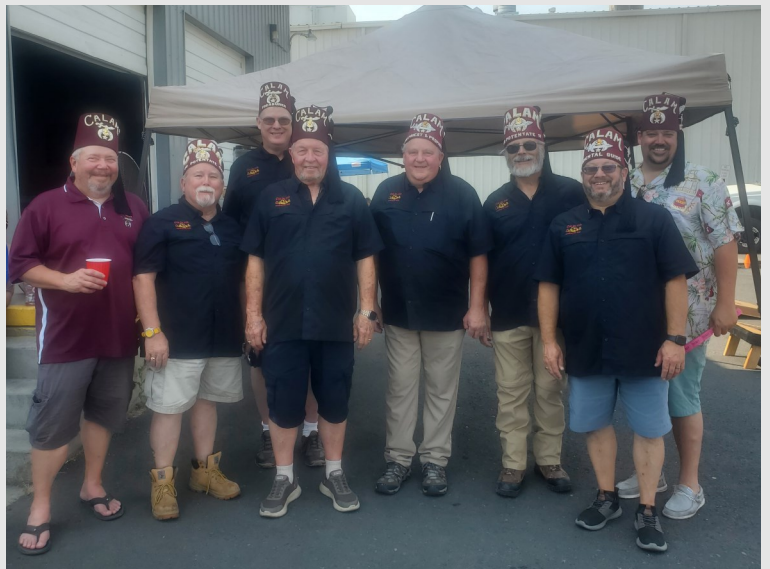
As always, thanks PP MP for photo captions!