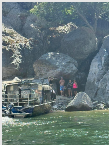
Winners of the smoke-off boat trip enjoy a day in the canyon.