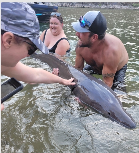
River trip winners pose with a sturgeon.